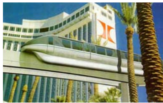
The new monorail system in Las Vegas