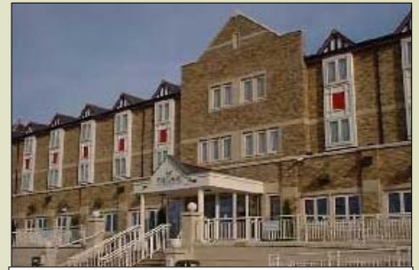
Village Hotel, Dudley, West Midlands

Online registration is now available on the Family Assistance Foundation's website at www.fafonline.org in the very near future. Check the website for updates or join the FAF mailing list to receive future updates. Registration does not include accommodations, but for those delegates requiring overnight